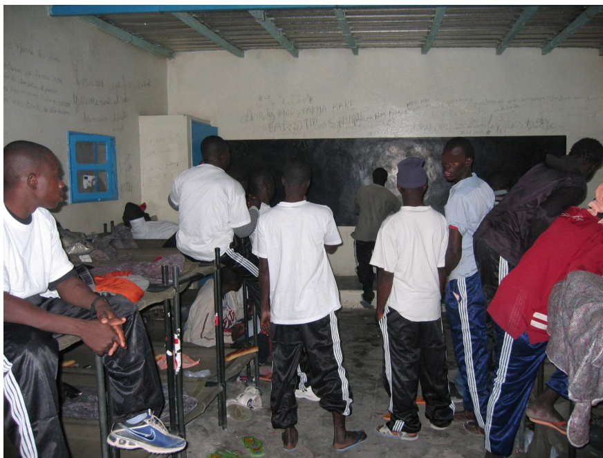
Migrants in the Nouadhibou Detention Centre

Corroborating information indicates that some members of the security forces do carry out arbitrary arrests of foreign nationals, notably nationals of ECOWAS countries. These people, arrested in the street or at home, apparently without any evidence, were allegedly accused of intending to leave Mauritania irregularly to travel to Europe. Some of these people, held at the detention centre at Nouadhibou to await being sent back to Mali or Senegal, told the Amnesty International delegation that they were legally present in Mauritania and that, at the time of their arrest, the security forces had torn up their residence permits. Amnesty International fears that these arbitrary arrests are one of the perverse effects of the pressure exerted by the EU on the Mauritanian government.