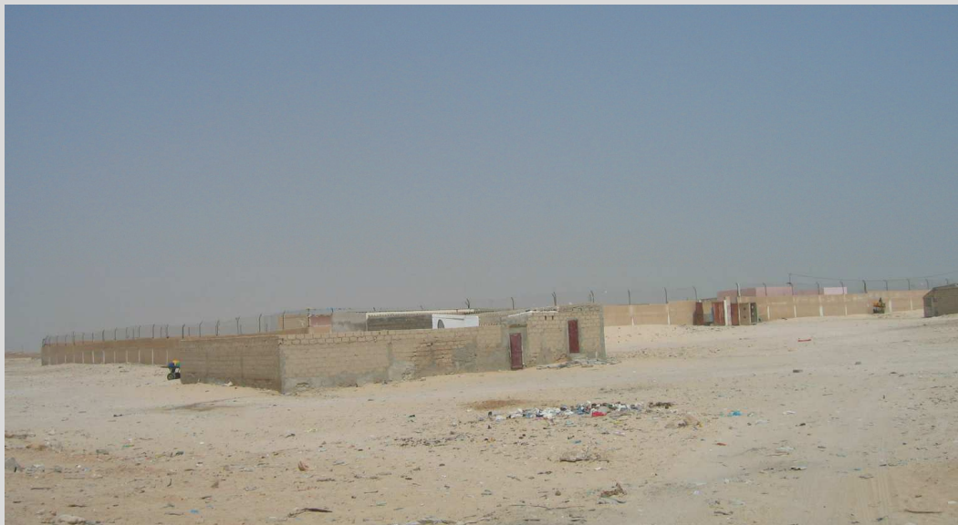
Nouadhibou Detention Centre

For its part, the Spanish party undertakes to support Mauritania in the construction and management of such centres". 23